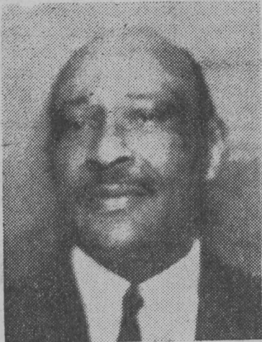
574 QM Railroad Co. Camp Shelby, Mississippi March 22, 1944