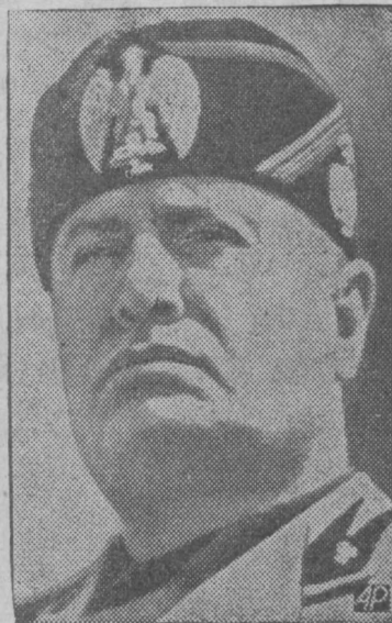
MUSSOLINI . . . DICTATOR

"Be not deceived; God is not mocked: for whatsoever a man soweth, that shall he also reap."—Gal. 6:7.