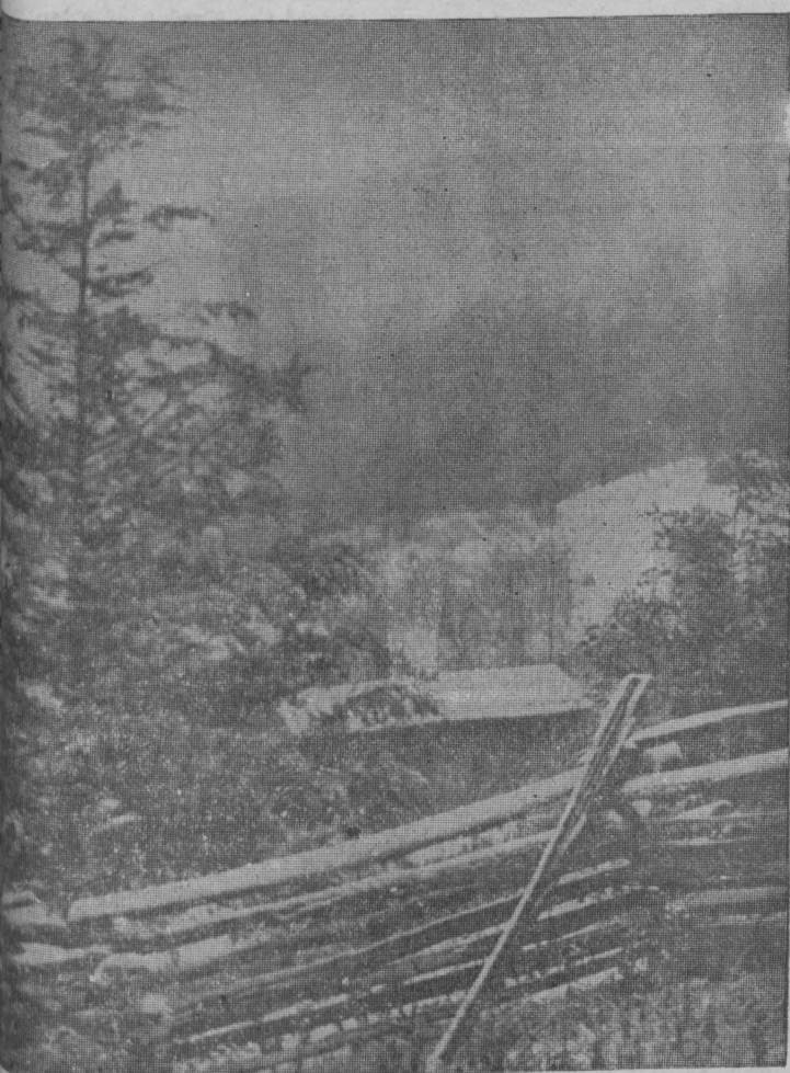
With freezing fingers the photographer stood in this snow storm the Pine Mountains of Kentucky last Christmastime to give you cooling draft in August.

What is "the world" as here mentioned? I answer, it is not a sphere, but an atmosphere; it is not a position, but a condition; it is not a place, but a power. It is any form of life—political, social, (Continued on page four)