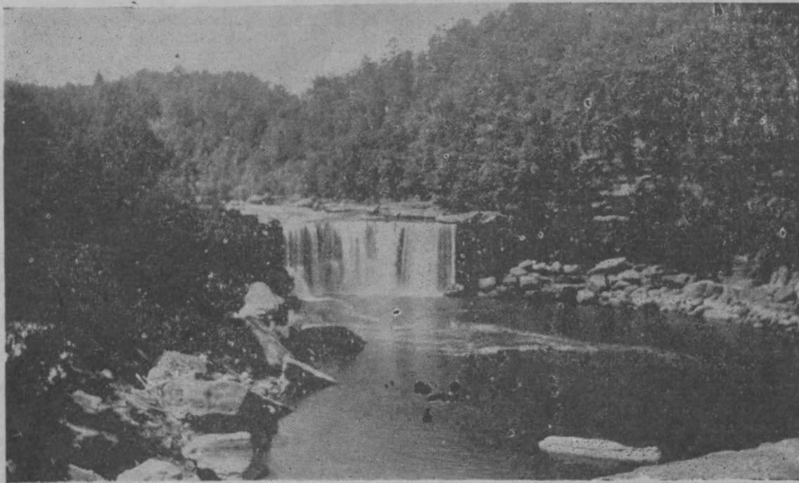
The Voice of God Is Never Hushed at Cumberland Falls, Kentucky.

"No," replied the man. "You (Continued On Page Three)