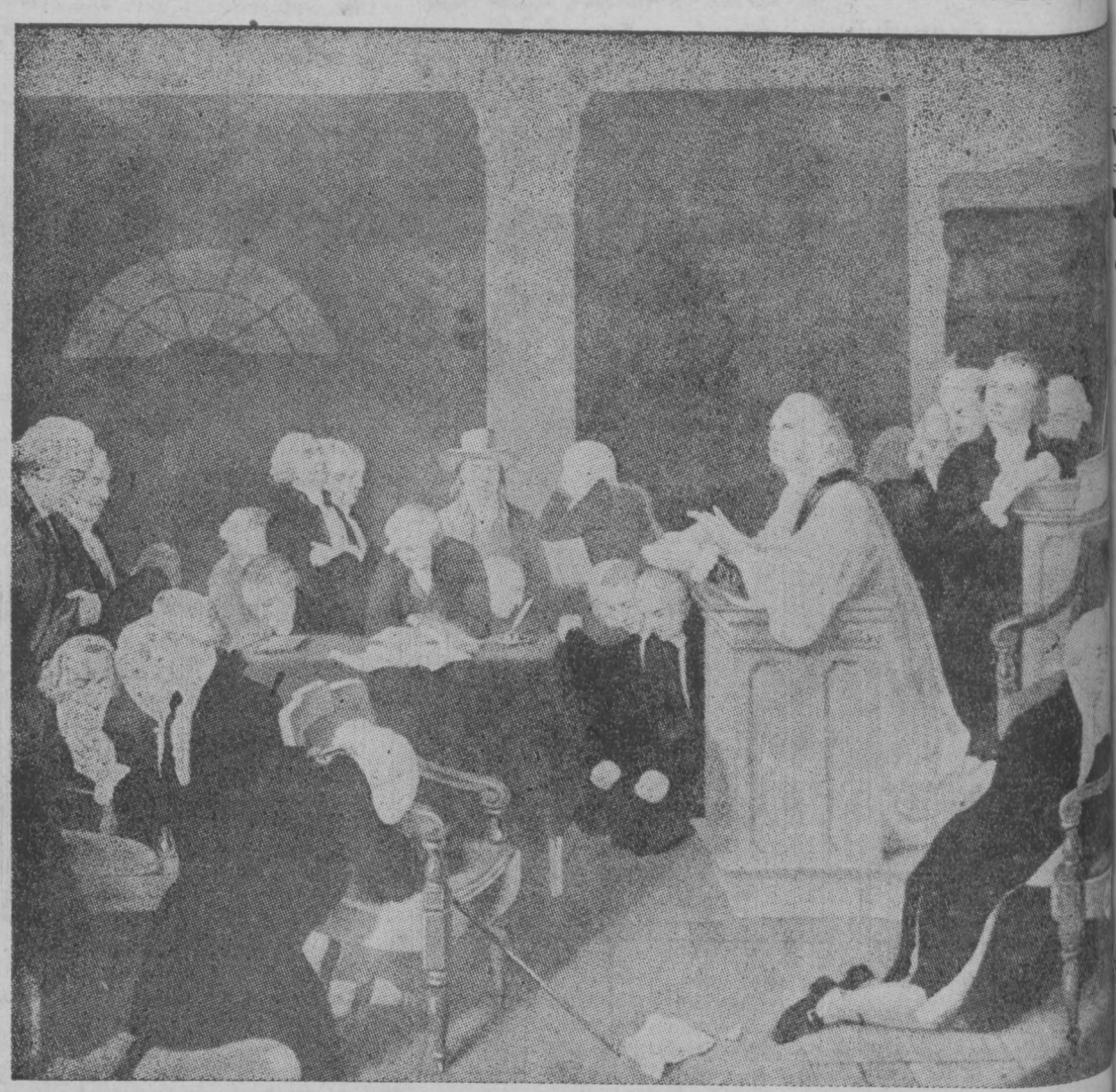
This was during the CRISIS which threatened defeat of Colonial Cause. PRAYER change course of Convention and SAVED AMERICA!

Said Benjamin Franklin: "OUR PRAYERS WERE GRACIOUSLY ANSWERED