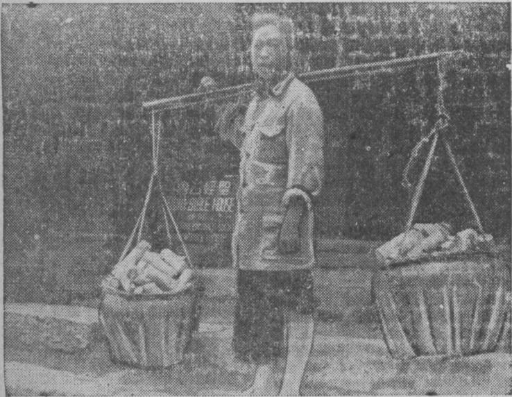
A messenger boy delivering Gospel portions in China