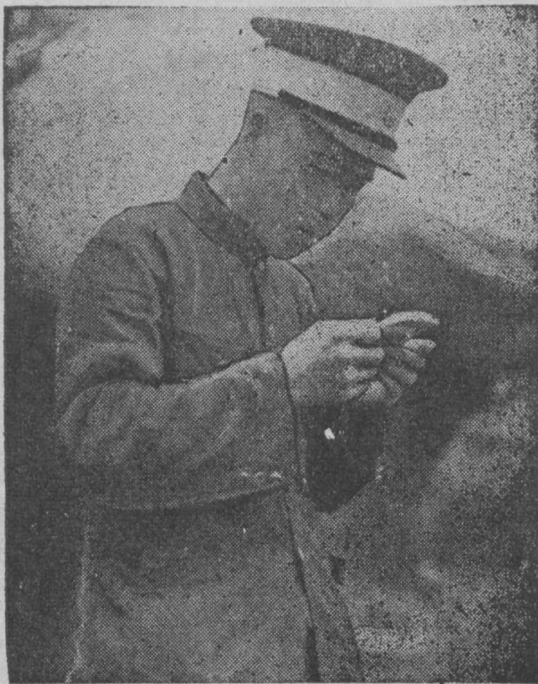
A village constable in North China reads the Gospel

and sending ourselves to the hospital and the grave. True happiness comes from a healthy mind and soul in a healthy body, living in harmony with the laws of God, and with an outlook on eternity. From home, friend, work, usefulness, achievement, godliness—these things bring happiness.