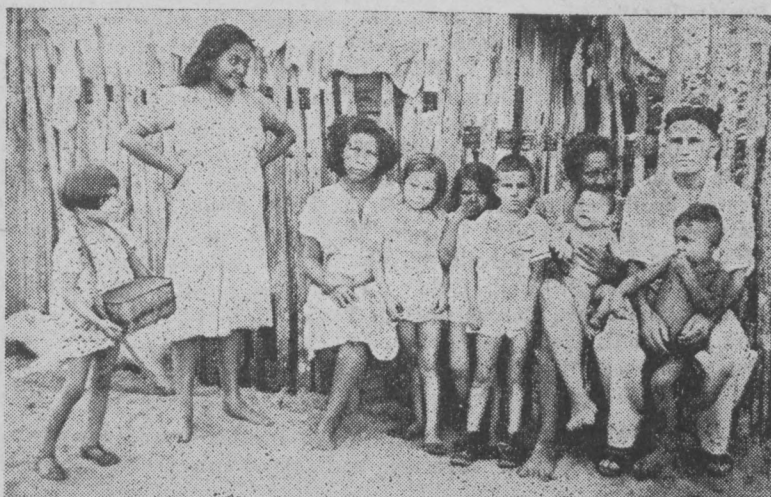
Many thousands like this Brazilian family have never heard about the gospel of the Lord Jesus Christ. The field is ripe unto harvest and workers are needed.