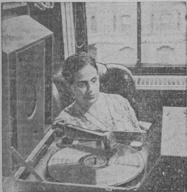
The Blind May Now Hear The Bible On 169 Talking Book Records