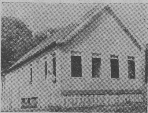
Mission Home and Headquarters in Cruzeiro do Sul where the native missionaries and

We, as Baptists, want to know where our mission money is going and what it is being used for. Out of the millions given for missions, most all of those who give it do not have the least idea where the money is used and what it is used for. Much of it is used for purposes that if the givers knew about, they would really rise up in protest and give elsewhere. We believe that the people who give for missions should be (Continued on next page)