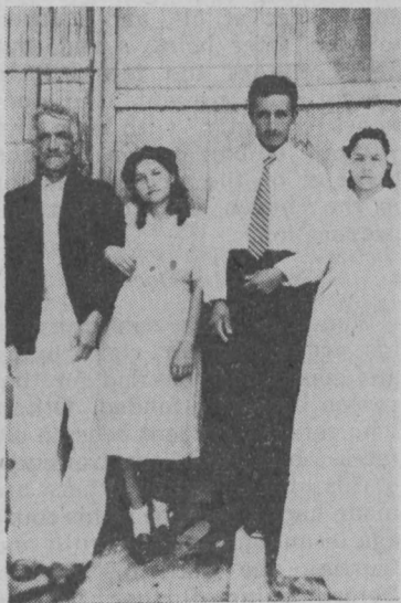
Two bridegrooms with their brides. All of these were baptized soon after getting married, and were in the organization of the church.