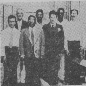
Group of men in organization of Baptist Church in Bueneventure, Colombia.