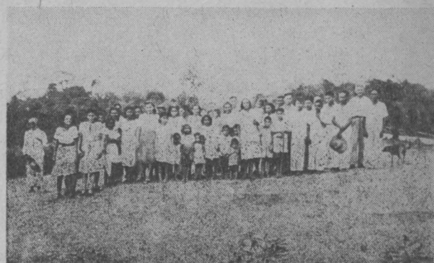
This is the group that the pastor found to preach to. One of these was saved and two other backsliders were restored to fellowship.