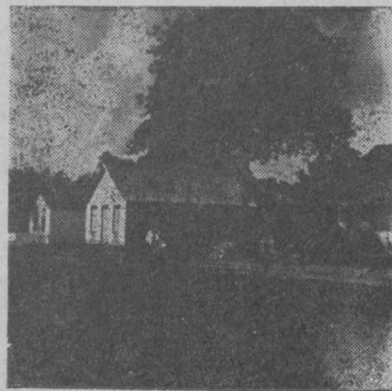
A glimpse of the most beautiful building in Cruzeiro do Sul, the meeting house of the Church of the Lord Jesus, the Cruzeiro do Sul Baptist Church.

To get the story of the journey, picture in your mind the Sunday morning service at the Church in Cruzeiro do Sul. Then the group leaves for the preaching point, passing through the business section of the town and then they get into a canoe in the Jurua River and go five miles down stream where the pastor preaches to the group shown in the picture. Now read Brother Brandon's letter and get the story.