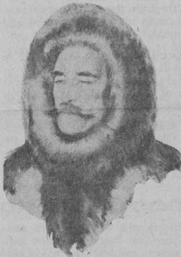
ROBERT EDWIN PERRY

On his trip to the North Pole he carried a pocket Bible and often refers to Christianity as man's greatest discovery. If you would discover Heaven, read your Bible.