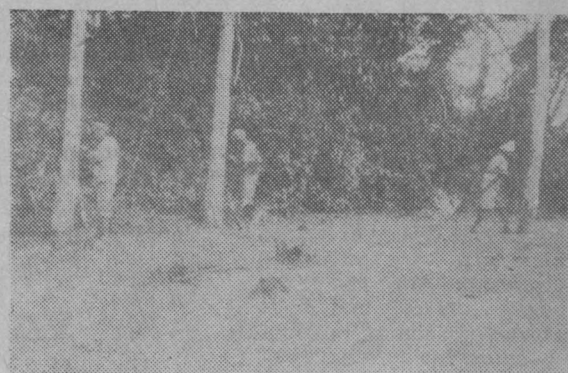
Here the men are cutting the rubber trees. Each man will cut about 200 trees each day, then smoke the rubber making it into a ball. These men are believers as a result of the work of Baptist Faith Missions.