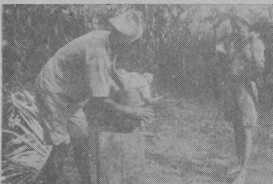
Rubber workers in the Acre Territory of Brazil, in the foothills of the Andes mountains. The man in the rear is smoking a ball of rubber. The one in the front is preparing a ball to be smoked and the other man is looking on.