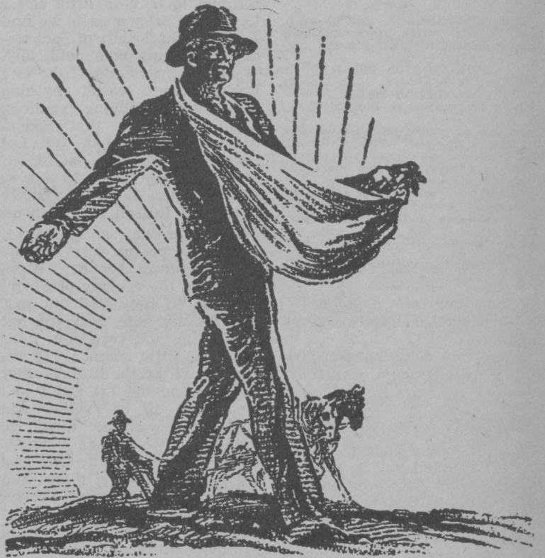
"Behold a sower went forth to sow." — Mt. 13:3

"He that goeth forth and weepeth, bearing precious seed shall doubtless come again with rejoicing, bringing his sheaves with him." — Psalm 126:6