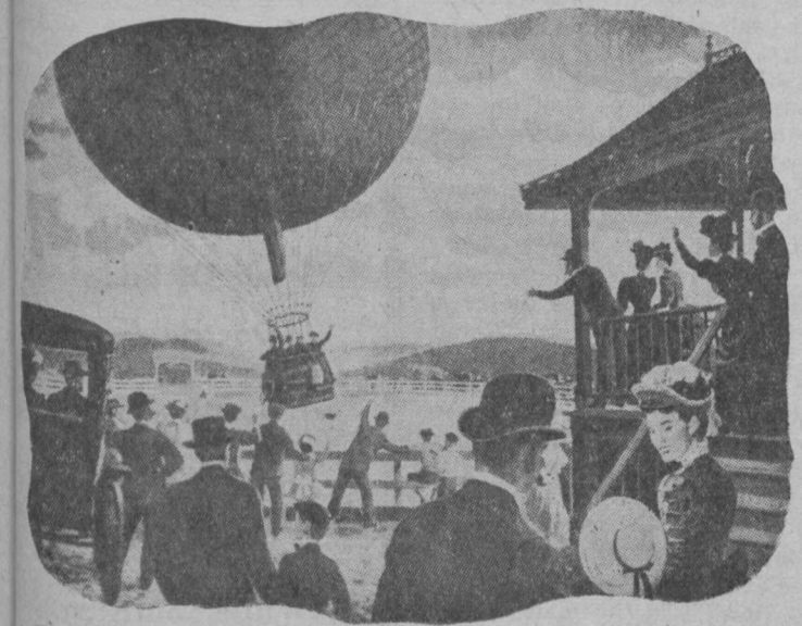
"There She Goes, Boys!"

Fifty years ago people took buggy rides for miles to see those daredevils actually leave the earth in that new-fangled contraption. Patiently they waited, every second packed with drama, until that breath-taking shout, "She's off the ground!" and a balloon ascension then, even the spectators were up in the air.