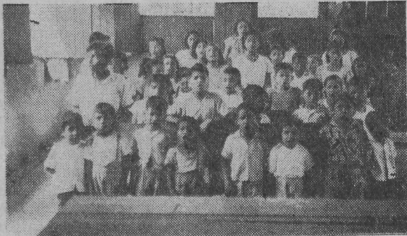
One half of the children singing.