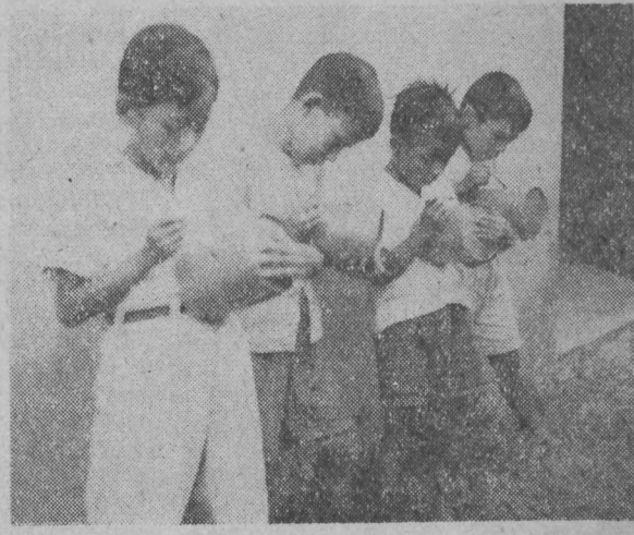
Some of the boys lettering cans to take home.