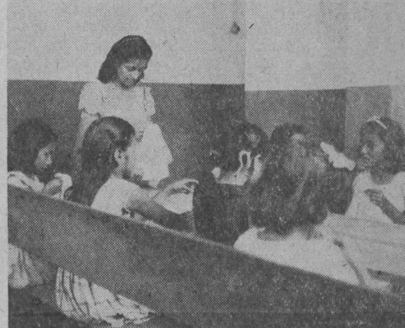
Primary girls at work.