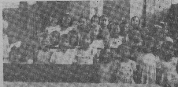
This is the other half singing.