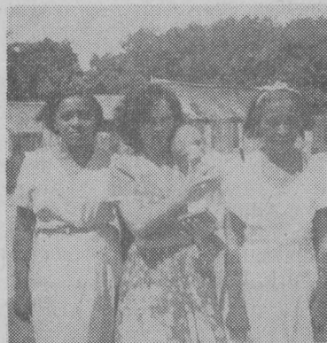
Three women recently saved. The old lady on the right is the one who took her crucifix off and threw it on the ground.