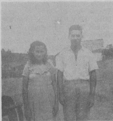
This man and wife were saved in a meeting in a home. They are waiting baptism.