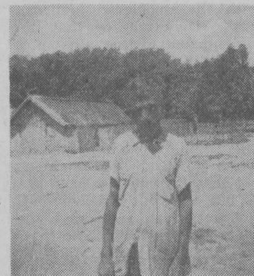
This is another picture of the 80 year old man that was saved. The glare through the window caused the other picture of him shaking hands with the pastor to be blurred.