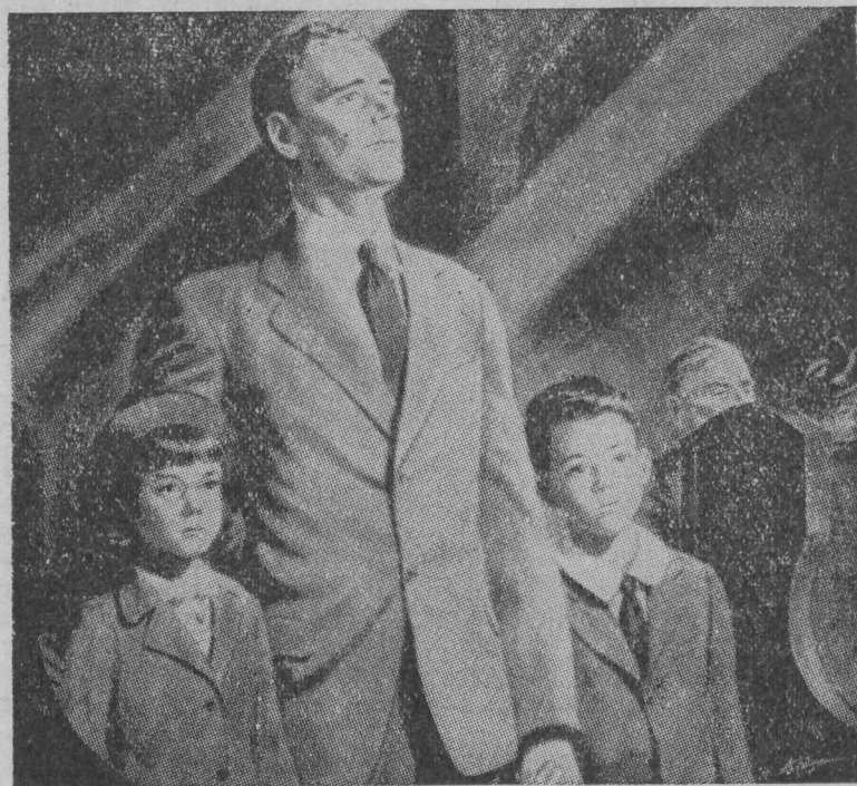
"Train up a child in the way he should go: and when he is old, he will not depart from it.—Proverbs 22:6.

joining a church and being baptized and living any way that you want to live. If the Lord Jesus Christ has saved you, he has an exhortation for you, and that is to glorify God with your body and with your spirit.