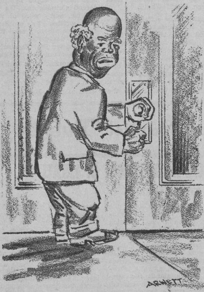
Pahson can' preach much ef he can' hit me.

"Mused Uncle Mose" is a 64-page book, of over 200 philoso- phical sayings, similar to the above, containing 20 full-page pic- tures. It costs $1.00 postpaid, and is worth every penny. Order from us.