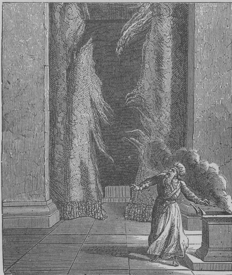
"The veil of the temple was rent in the midst." (Luke xxiii., 45.)

hope, and the glorious appear- ing of the great God and our Saviour Jesus Christ."