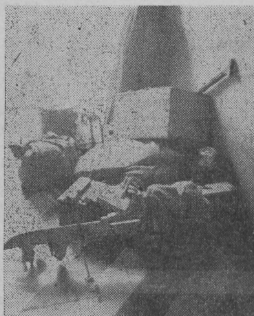
Here is what is taken on a missionary journey up river. Everything that is needed must be taken along: cot, food, thermos of drinking water (boiled), lanterns, outboard motor and gasoline.

of my financial situation. There are already enough Christians from our church in the area to start a permanent work as soon as we get a house to start in or one of them gets a house large enough to have Sunday School