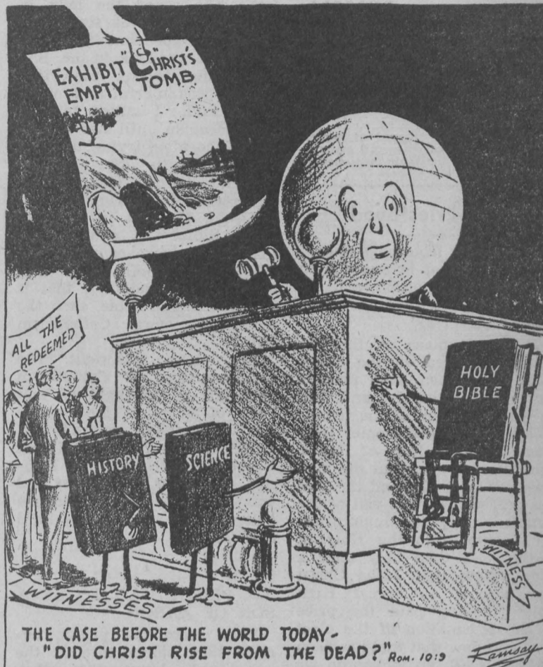
The most authenticated fact of all history is that Christ rose from the dead and this is proven by history, science, born-again believers and the Bible.