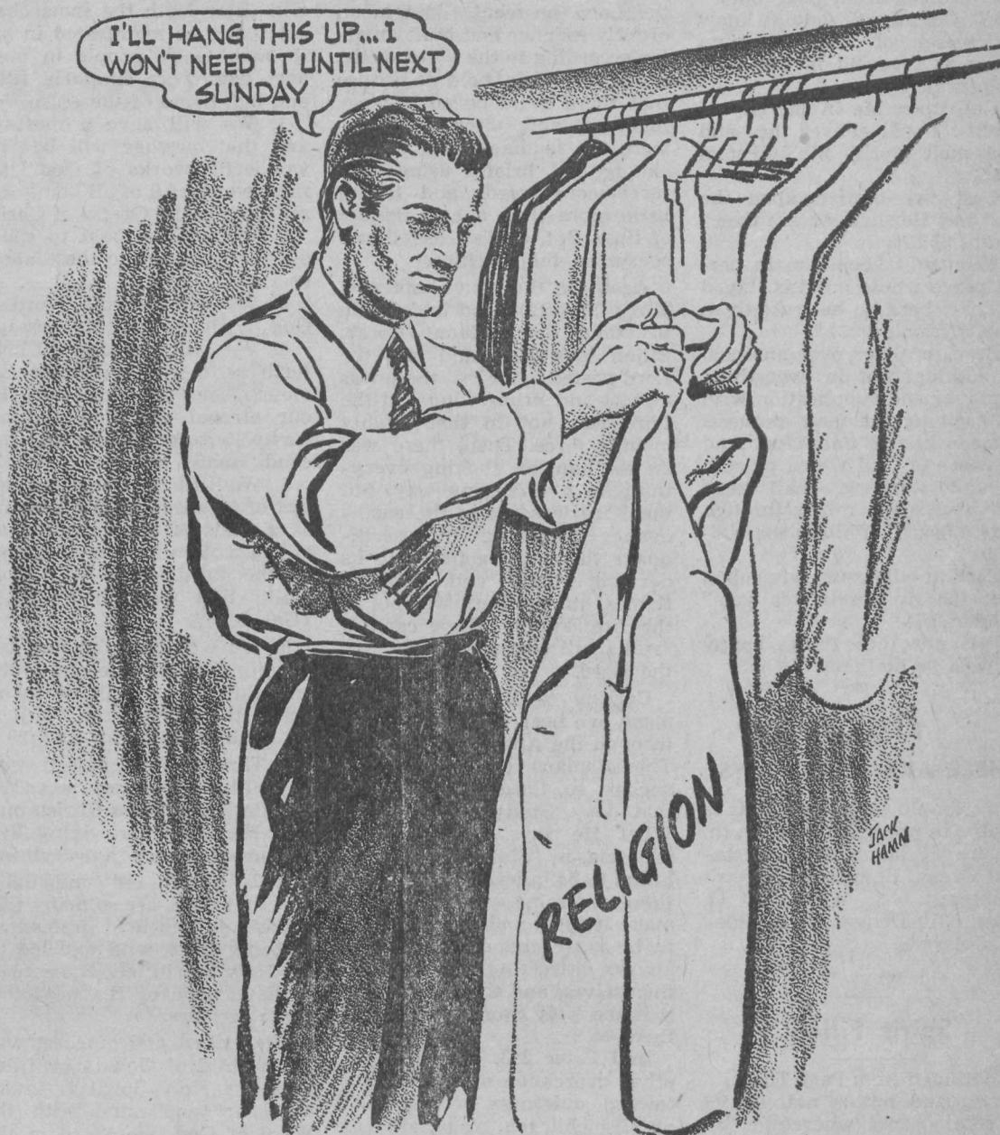
"THE HYPOCRITE'S HOPE SHALL PERISH" — JOB 8:13

I'LL HANG THIS UP... I WON'T NEED IT UNTIL NEXT SUNDAY