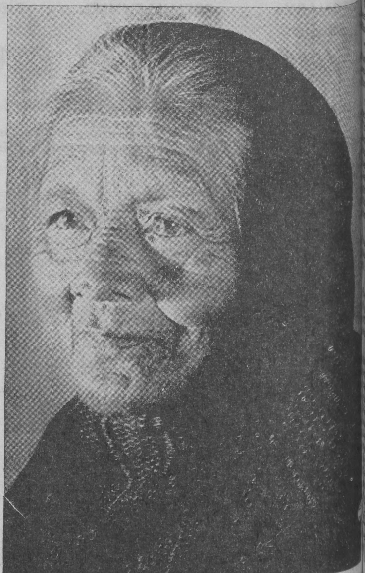
"I have been young, and now am old; yet have I not seen the righteous forsaken, nor his seed begging bread."—Prov. 37:25.

seven angels which had the seven vials, and talked with me, saying unto me, Come hither; I will show unto thee the judgment of the great whore that sitteth upon many waters; And upon her forehead was a name written, MYSTERY, BABYLON THE GREAT, THE MOTHER OF HARLOTS AND ABOMINATIONS OF THE EARTH!"—Rev. 17:1, 5.