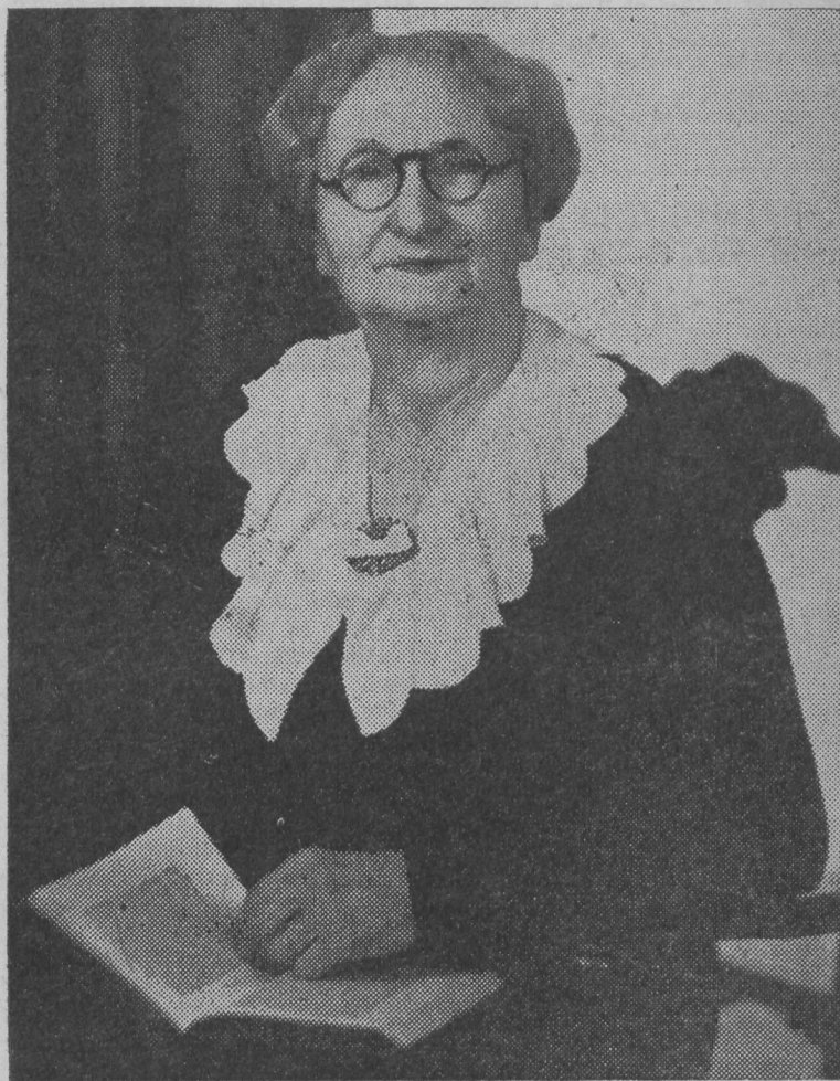
(Story on page two)