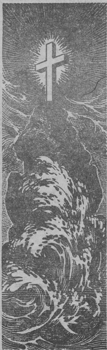
"Jesus, Saviour, pilot me Over life's tempestuous sea."

Now, beloved, in view of the fact that this is a railroad town and you are familiar with railroad terminology, let me remind you that the children of Israel are just like a railroad car that has been put off on to a side track and left there, while the Gentile people today are on the main line. In the days gone by, the Jew was God's chosen people and God blessed the world through the Jew. Originally, the Jew was on the main line, but God, in the days of Jesus Christ, pushed the Jews off to a side track, and from that time on Gentile people have been on the main line. Some of these days God is going to pick up those Jews that He put on the