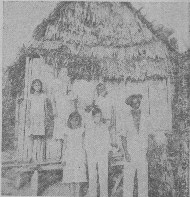
These people heard the gospel also. Note the shack that they live in on the bank of the river. This shack is their home. This home and many others like it along the different rivers have had the gospel preached to them. When you visit a place like this you wonder how the people ever got to a place like this to begin with.