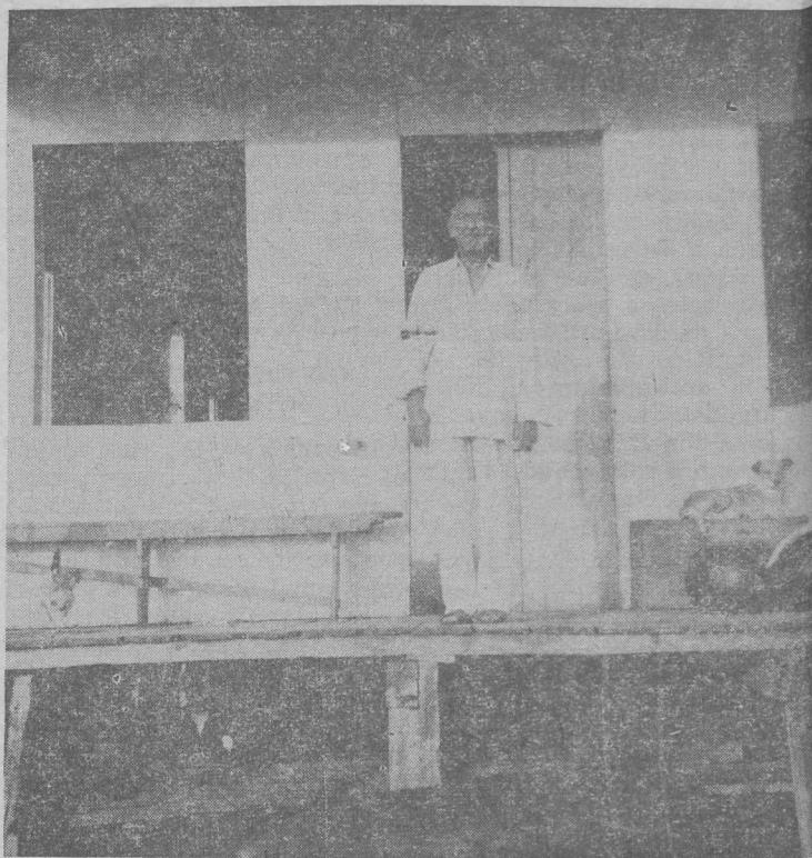
This man is the owner of the rubber plantation at Tres de Maio (where the houseboat is tied up. See picture on front page). This man is a Catholic but shows interest in the gospel and wants to know more. Note the balls of rubber on the porch and also the dogs on the porch and under the porch.