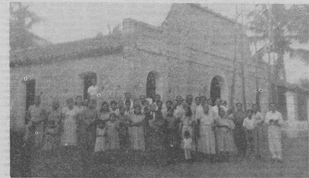
This picture was taken shortly after the baptismal service in Vicente Guerrero and after they had returned from the river to the church.

It was just a short time after this that the church in Vicente Guerrero met in a regular Sunday service and authorized a letter to be written to the Cen-