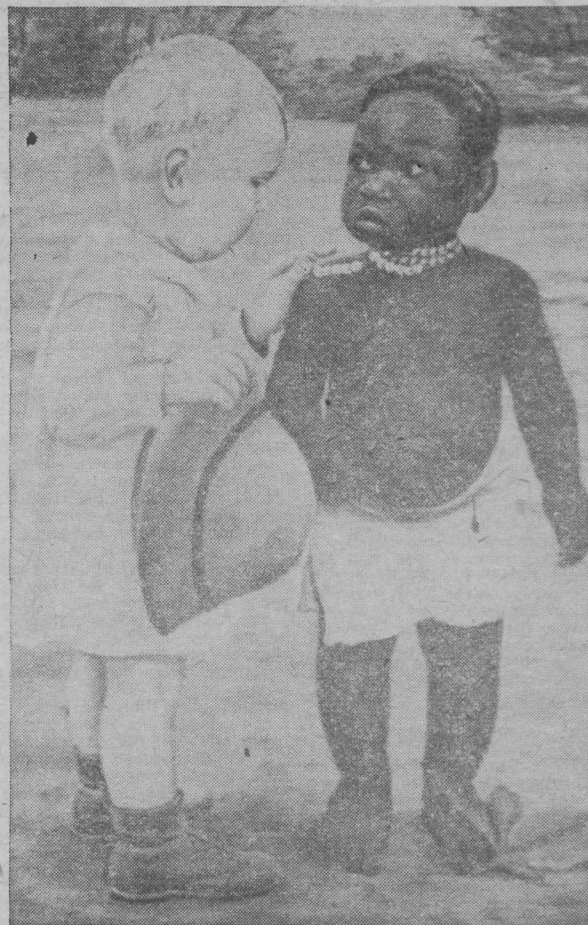
MANY HAVE NEVER HEARD

More time and early hours for prayer would act like magic to (Continued on next page)