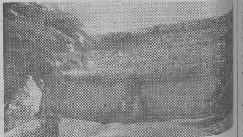
"WORLD'S LARGEST TREE"