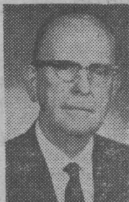
701 Cambridge Birmingham, Ala. BIBLE TEACHER Philadelphia Baptist Church Birmingham, Ala.

It seems that these friends are right in their assertion that the word "Elders" (PRESBUTEROS) in the New Testament is plural in most cases. And I am persuaded that our present day churches have departed from the New Testament pattern in more ways than one. But when we try to determine just what the exact function of the pastor, the bishop and the elders was in the early churches we may very well get dizzy.