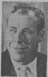
PASTOR, Arabia Baptist Church Arabia, Ohio

I will agree that there was a plurality of elders in some churches, but this was not true in every church. I disagree with their theory that the practice of one pastor over each church is a departure from the New Testament pattern. The New Testament, as well as the Old Testament, reveals that there was always a man who was the overseer (pastor-bishop-shepherd) of the assembly. When Israel (type of the church) came out of Egypt, she came out under one shepherd, who was Moses, and when Moses was taken from them, another one was selected, who was Joshua. In the new testament times, this policy was still intact.