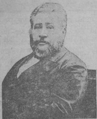
CHARLES H. SPURGEON

Brethren, the heathen are perishing, and there is but one way of salvation for them, for there is but one Name given under heaven among men whereby they must be saved. God in the glorious unity of His divine nature is calling for messengers who shall proclaim to men the way of life. Out of the thick darkness my ear can hear that sound mysterious and divine, "Whom