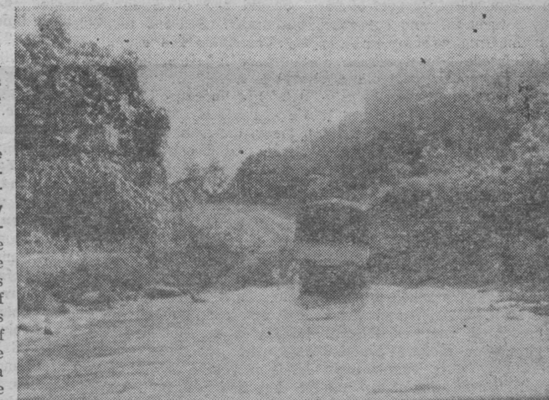
(6) While we had spent a week on Bougainville, all of the flood waters had not gone down when we left. There had been enough repair work done and new stretches of road cut out through the bush that a 4-wheel drive vehicle could get through, so we were able to drive all the way to Kieta. This picture shows a vehicle as it was just getting across one of the rivers. I was in another vehicle behind this one when I made this picture. Beloved, whether it be on the island of Bougainville or Papua, New Guinea, the life is pretty rugged at times but we love every moment of it. I am more convinced each day of my life that God equips and calls certain men for certain jobs. There has to be more behind a missionary than for an individual just to "feel that this would be a good thing to do." Not only does God equip certain men for certain tasks, but He also directs the individual to the exact field where He would have him labor. Beloved, there is no credit that goes to me for being able to spend the last 20 years of my life here in this rugged country, and love every moment of it. It has already been proven that not every one can take this type of life, to say nothing of enjoying it at the same time. I am thankful for the sufficiency of God's marvelous and amazing grace. I hope you have enjoyed this series of photos of our work here. We will soon have some more pictures for you.