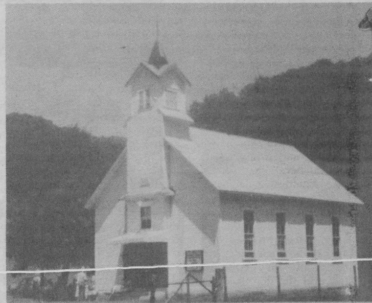
A fine church in a beautiful setting. Dessie Baptist Church.

This is a sister church, believing the same truths as are preached through the pages of The Baptist Examiner. The church publishes a paper: The Voice In The Wilderness, which is a blessing. I do hope God will again, some day, grant me the honor of visiting and preaching in this fine church. Pray much for this little flock and its very able under-shepherd as they seek to spread the Word of God in the hills of West Virginia.