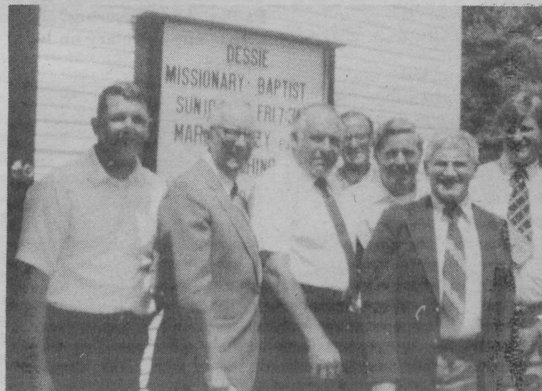
Some who preached