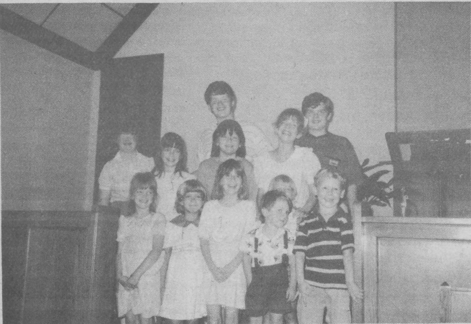
Some fine young people at our conference.