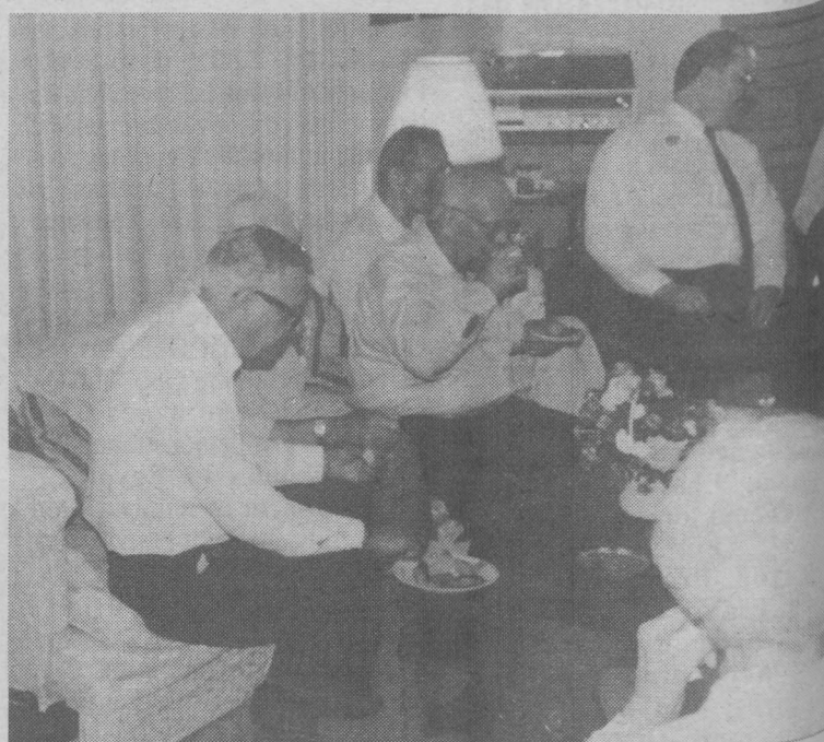
Fellowship at the parsonage.