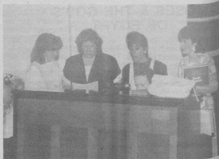
Some women from Michigan (Grace Baptist Church of Gladwin) get ready to sing.