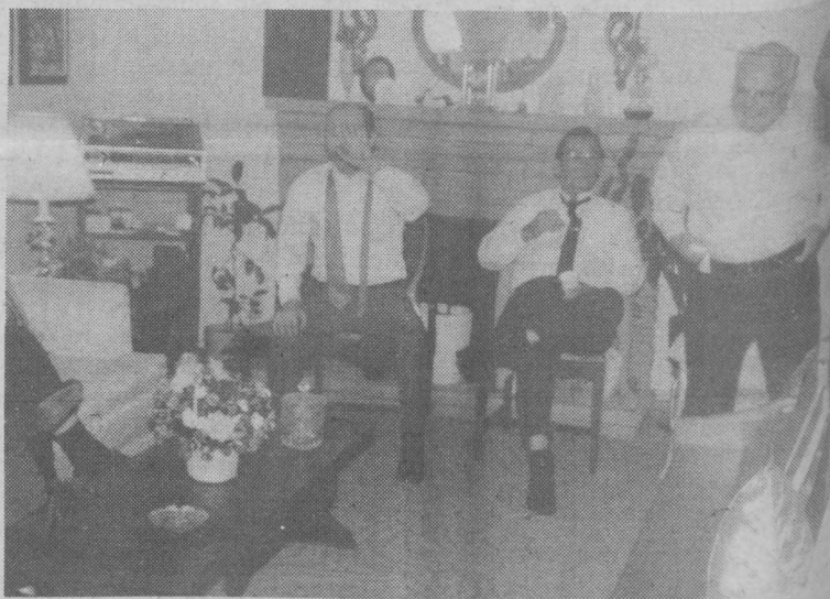
More fellowship at the parsonage.