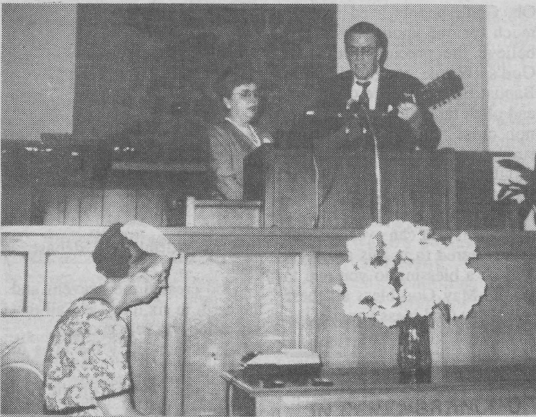
Our own Whitts sing for us.