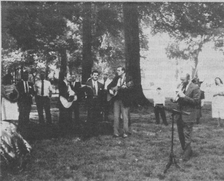
Service in Central Park.