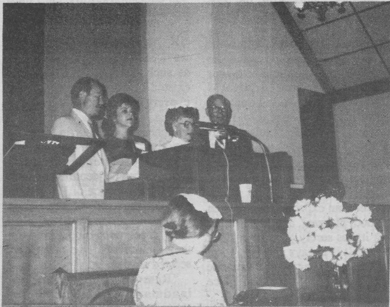
Some members of the West family bless us with a song.